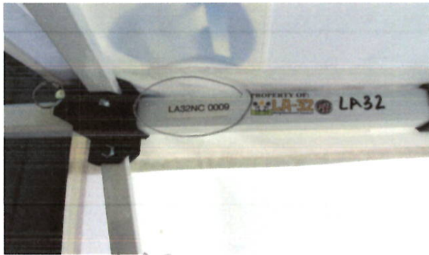
LA32 NC 0009